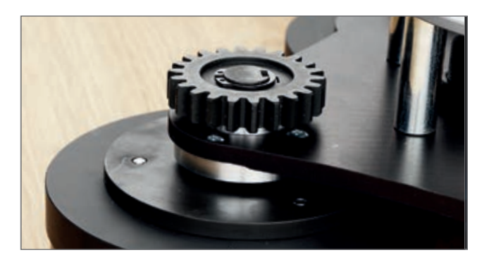
The unique cog wheel design of Bona Power Drive NEB.