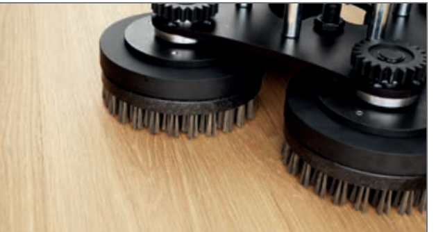
When used with any type of surface treatment, outstanding Click-on mount with strong hexagon fitting. effects can be achieved.