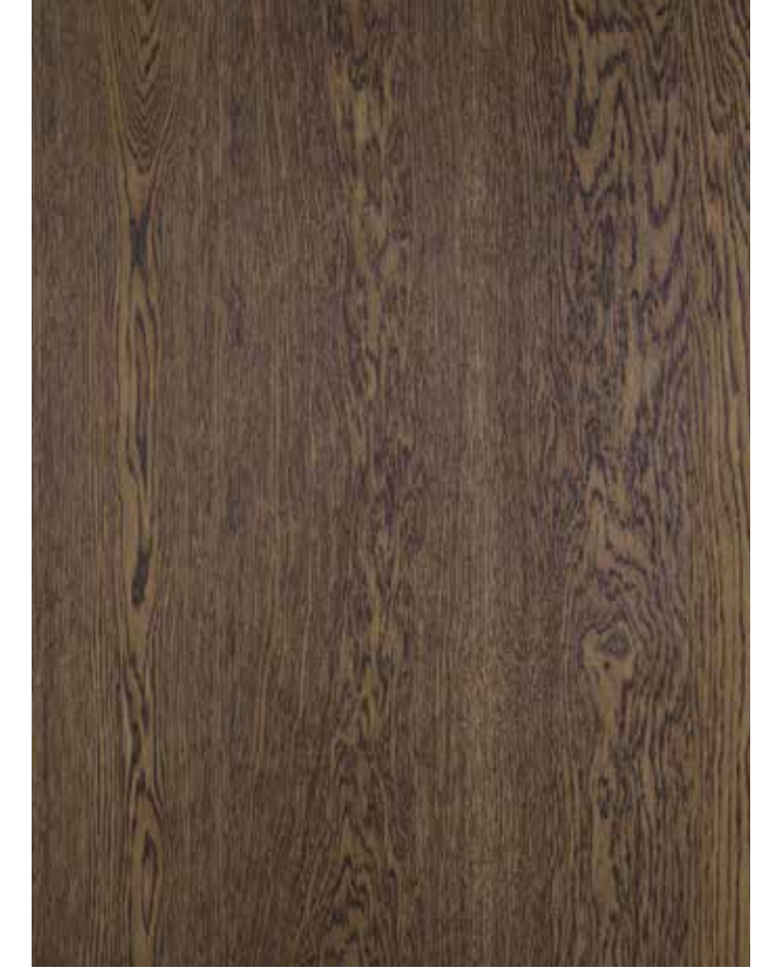
Malibu Rock applied on brushed white oak. Results will vary depending on the colour and type of your original wood floor.