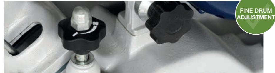
FINE DRUM ADJUSTMENT

Pressure adjustment from the top makes it easier to adjust the pressure. There are two defined drum pressure values (15 and 22 kg). The new way of adjusting the drum pressure enables a perfect end result. Combined with the smoother lowering of the drum, the performance increases dramatically.