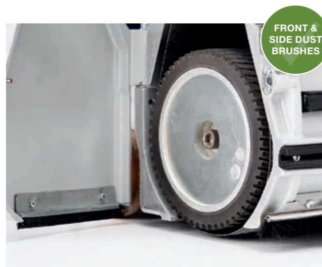
FRONT & SIDE DUST BRUSHES

The safety button locks the drum, preventing it from falling on the floor and causing damage.