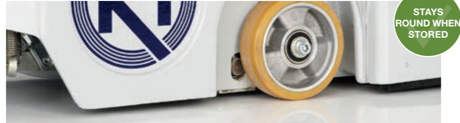
STAYS ROUND WHEN STORED

Reduced vibration and risk of chatter marks thanks to Bona Belt UX's durable wheels, which stay round when the machine is stored. Wheel adjustment is operated from the top, making it easier to handle. Smaller diameter wheels also increase sanding effect and pressure.