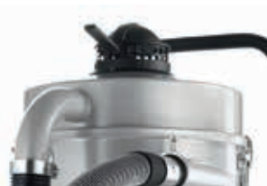
Pressure release valve for easy filter clearing