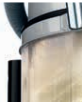
Unique 2-step cyclonic filter separation process