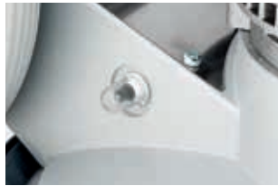
Thermal and power overload fuse ensures operational safety