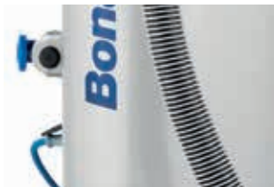
Fully sealed system keeps indoor air perfectly clean