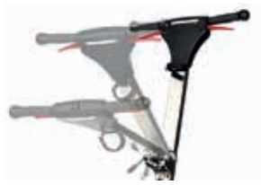
Folding and stepless shaft adjustment for easy handling