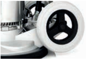
Large wheels for easy transportation