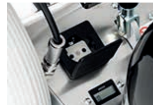
Power outlet for optional accessories