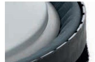
Dust protection skirt on cover plate is self-adjusting in height