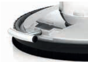
Handles on the cover plate make it easy to carry