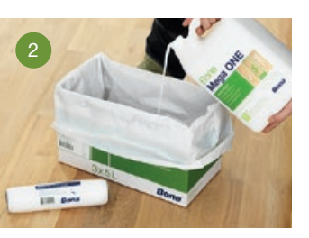
Pour out and fill the tray with Bona Mega ONE.