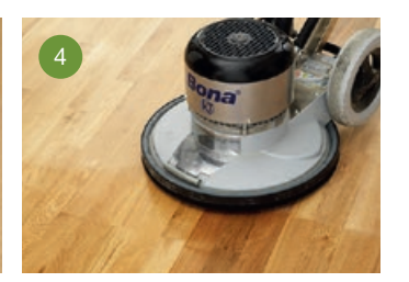
with Bona FlexiSand.