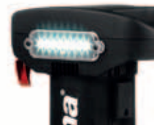
LED lights for better visibility