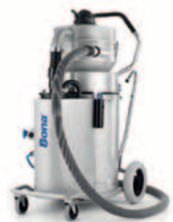
For optimal dust reduction use Bona DCS 70