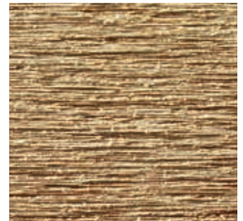
The surface that has been sanded by Bona Abrasives is smoother, more even, with visibly less fibre ripping.