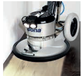
Ability to sand back down to bare wood with Bona Power Drive and Bona FlexiSand 1.5